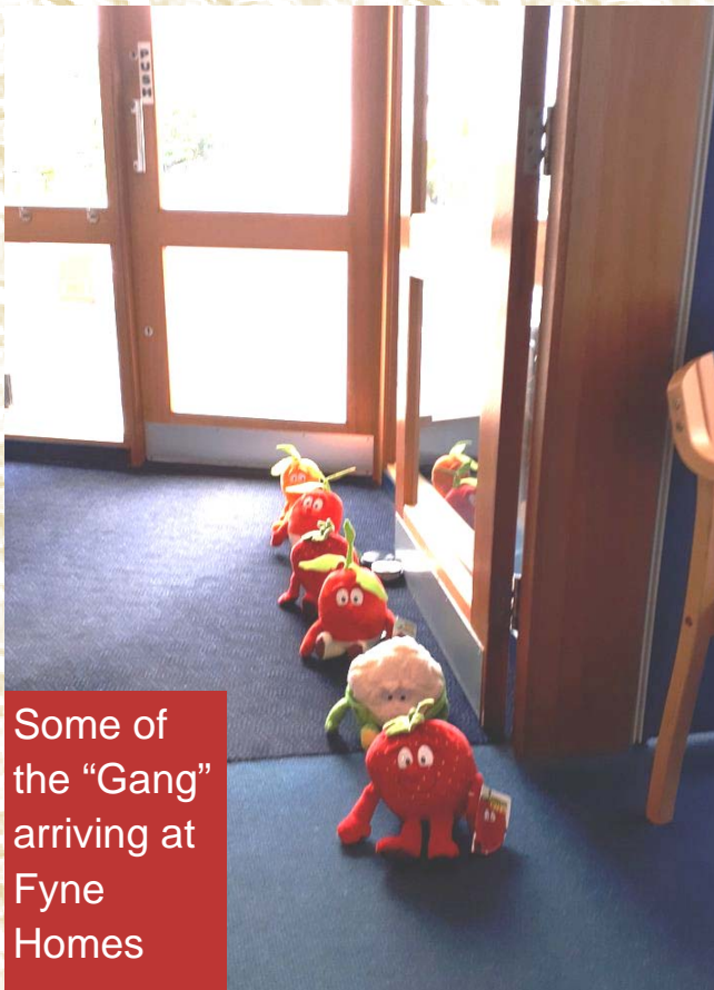
Some of the "Gang" arriving at Fyne Homes